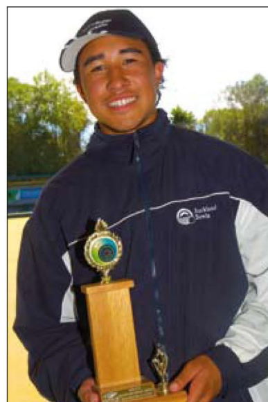
Winning the 2006 National Secondary Schools Championships.